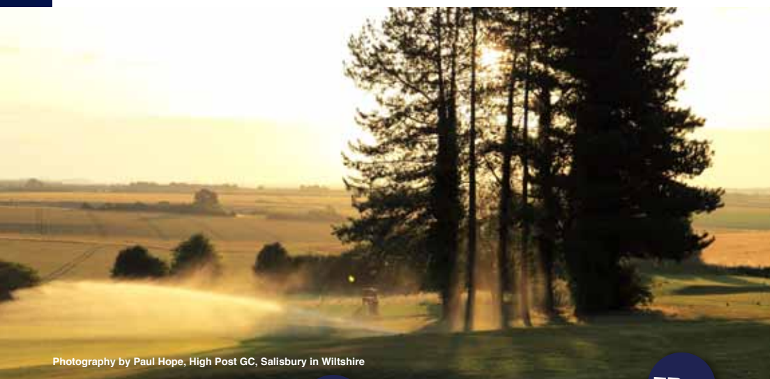
High Post GC, Salisbury in Wiltshire