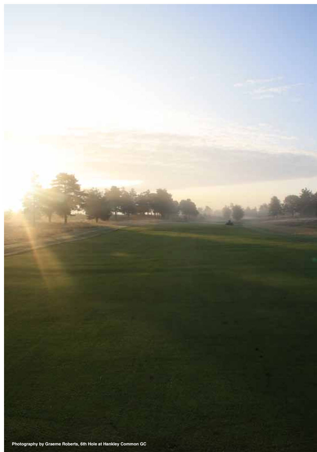
6th Hole at Hankley Common GC