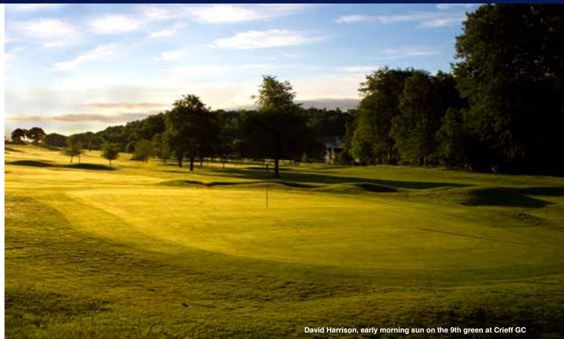
David Harrison, early morning sun on the 9th green at Crieff GC

CANCELLATION POLICY - Cancellations must be received in writing. Cancellations received prior to 23 December 2011 will be refunded in full, less a cancellation fee of £35. No refunds will be given for cancellations received after 22 December 2011.